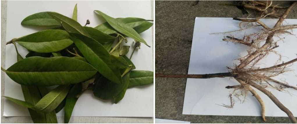
Fig 2. Acrostichum aureum – golden leather fern leaves and roots