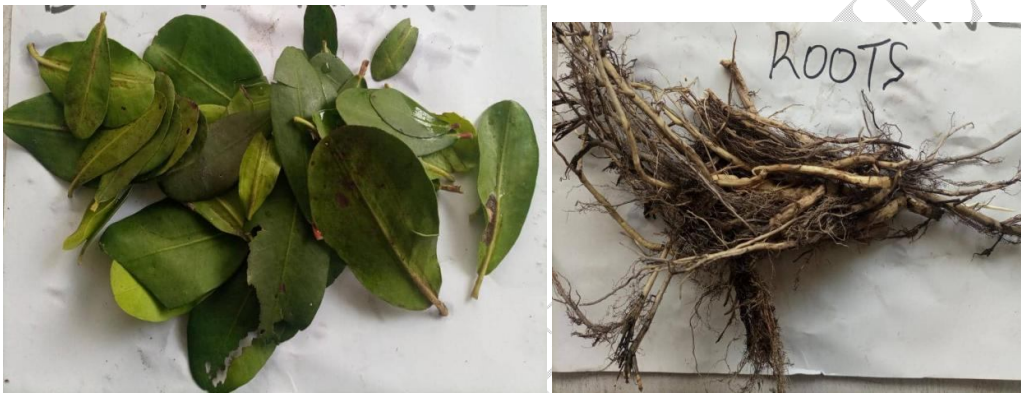
Fig 3. Avicennia germinans – Black Mangrove leaves and roots