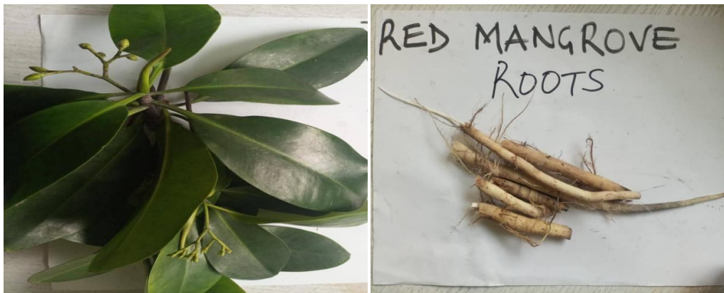
Fig 1. Rhizophora mangle – Red Mangrove leaves and roots

The three mangrove plant samples (roots and leaves) were collected from the Bonny Jetty waterfront (Okrika) in Old Port Harcourt Township, Rivers State, Nigeria. The location is situated at Longitude 4^{\circ} 45' 10.13976'' N and Latitude 7^{\circ} 14' 13.012'' E at Bonny water front. The roots and leaves collected were separately placed in sterile polyethylene bags, transported aseptically first to the Department of Plant Science & Biotechnology Laboratory to be identified before being transferred to the Microbiology Laboratory, all of Rivers State University, Port Harcourt for immediate processing.