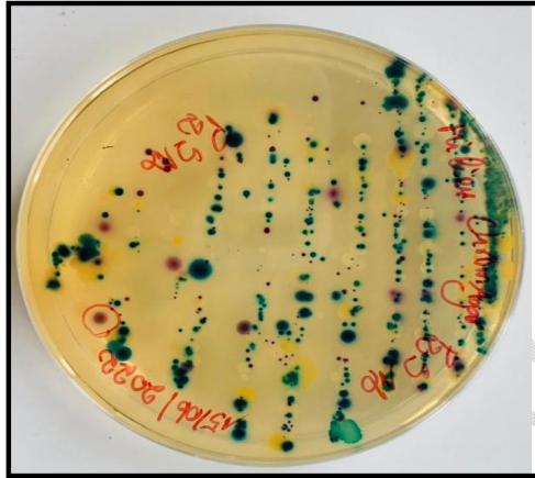
Figure 2: Growth of bacteria from the urinary tract of house mice on ChromAgar™ chromogenic differential medium