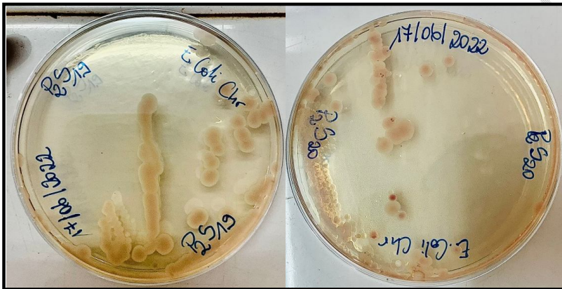
Figure 3: Escherichia coli colonies on chromogenic medium specific E. Coli O157: H7