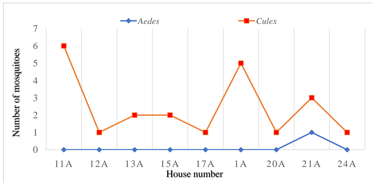
Figure 2. Distribution of mosquitoes in the rooms.

Aedes mosquitoes were found resting in a house and one room with no occupant had 3 Culex mosquitoes (Figure 2). No Anopheles mosquito was captured during the study.