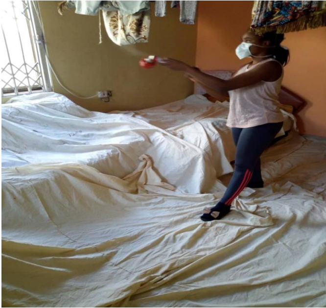
Figure 1a: Spraying of a room with Pyrethroids Spray