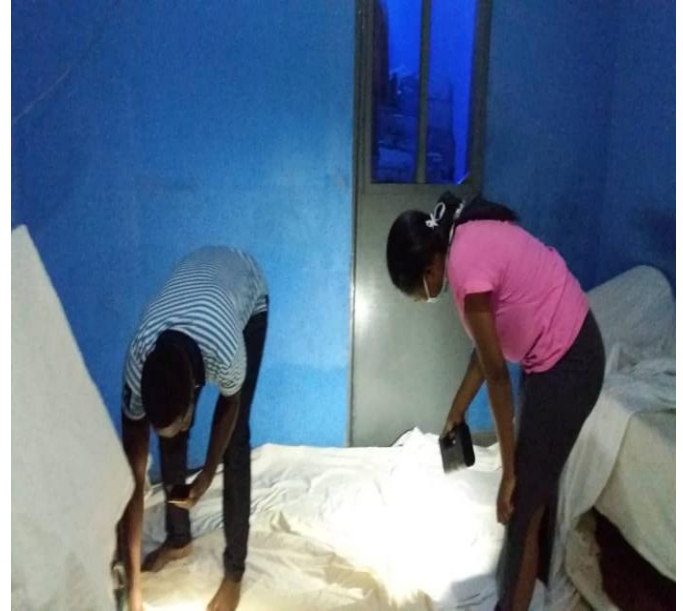
Figure 1b: Collection of knockdown mosquitoes