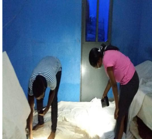
Figure 1b: Collection of knockdown mosquitoes