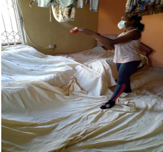
Figure 1a: Spraying of a room with Pyrethroids Spray