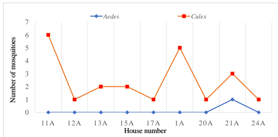
Figure 2. Distribution of mosquitoes in the rooms.

Aedes mosquitoes were found resting in a house and one room with no occupant had 3 Culex mosquitoes (Figure 2). No Anopheles mosquito was captured during the study.