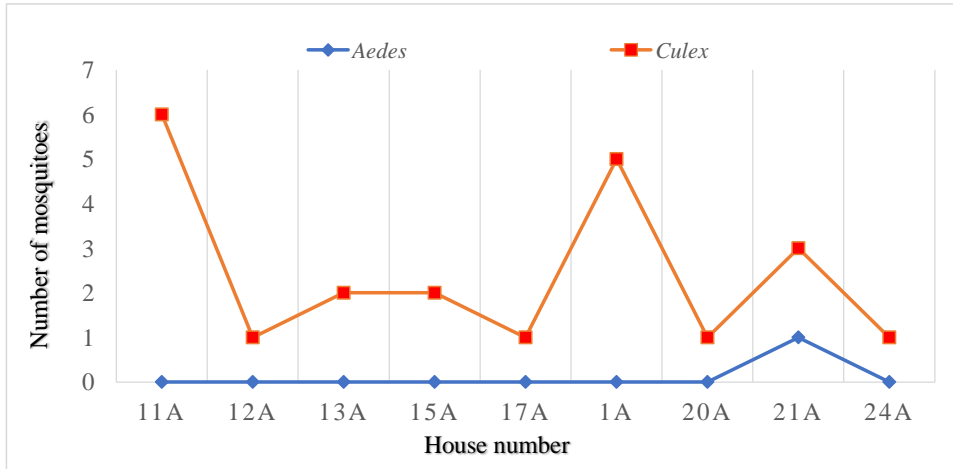
Figure 2. Distribution of mosquitoes in the rooms.

Aedes mosquitoes were found resting in a house and one room with no occupant had 3 Culex mosquitoes (Figure 2). No Anopheles mosquito was captured during the study.