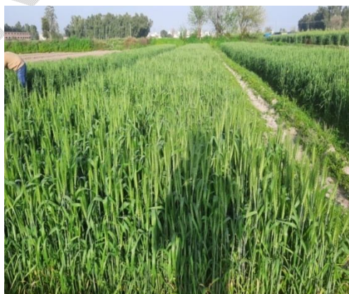
Figure 1 : Preparation of field for the sowing of wheat crop Figure 2: Wheat Crop at 90 days after sowing