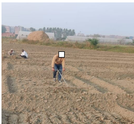
Figure 1 : Preparation of field

The data collected for all the parameters were subjected to analysis of variance (ANOVA) and was analyzed statistically. To determine the standard error of the mean (S.Em) and the value of CD (Critical difference) at a 5% level of significance, a methodology stated by Gomez and Gomez (1984) was followed to determine the specific differences between pairs of means.