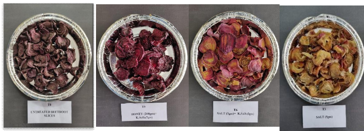
Fig : 2 An overview of osmotically dehydrated and sun dried beetroot of some different treatment combinations (Laboratory, Department of Horticulture at NAI, SHUATS, Prayagraj during 2021-22).