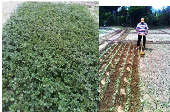
Photo 4. Trianthema spp control at early stage by Agricultural Weeder with Nail Assembly.