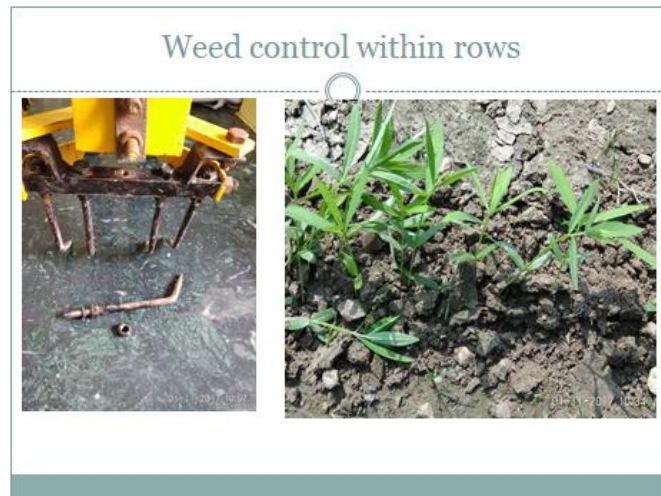
Photo 5. Weed control “within rows” in sunnhemp by Agricultural Weeder with Nail Assembly opening its central nail.

2.2 Time of application, precautions and procedure of use of the tool: For composite weed control at emerging stage, the tool with its nails has to be operated with to and fro movement at field capacity stage of soil (5-7 DAE, days after emergence of crops, photo 3 &4). The operating depth should be 3-4 cm on an average. Opening the central nail, the tool can be operated over crop rows (10 cm tall) and the weeds within the rows can be controlled (Photo 5). For controlling established weeds in between rows the scrapper has to be fitted behind the tool and can be operated since 15 days onwards. Single wheel arrangement has also been made for weed control in close growing crops (like onion, jute, rice etc), To operate the tool in transplanted rice the front wheels and the nail assembly should be removed and conical rotors and the boat has to be fitted. This can be operated in transplanted rice field since 8-10 days after transplanting (Photo 2). For flexibility in use, scappers, tines, conical rotors and boats can be fitted with the tool using nut and bolts (Ghorai, 2019). Operating the tool at field capacity, keeping 7-10 cm gaps in between two successive runs, simultaneous weeding, thinning, line arrangement and soil mulching is done in broadcast jute, mesta, mustard and, sesame etc (Photo 3). The “Nail assembly” is used for early weed control and mud stirring in transplanted rice field, fitting it with 3- 4 feet long bamboo/wooden handle.