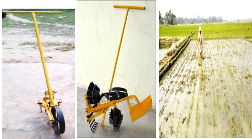
Photo 2. Agricultural Weeder with Nail Assembly having single front wheel and addition of conical rotors and boat for operation in transplanted rice (from left).