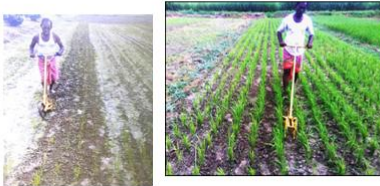
a) Mechanical weeding in upland direct seeded rice (DSR) and transplanted rice