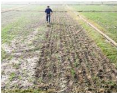
b) Mechanical weeding in wheat