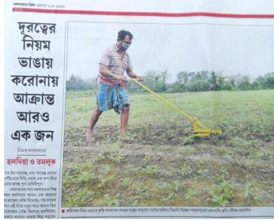
e) Bengal gram (Chick pea) f) Coverage of Agricultural Weeder with Nail Assembly in farmers field by Bengali leading newspaper “Ananda Bazar Patrika”

ACKNOWLEDGEMENTS: The author acknowledges the help of ICAR-CRIJAF and AICRPJAF and Department of Agriculture, Government of West Bengal for their help in development and its popularization across jute growing states of the country.