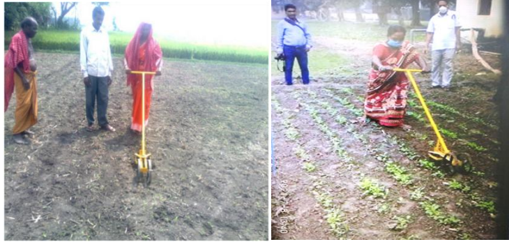
Photo 7. Women working with Agricultural Weeder with Nail assembly in jute and mustard