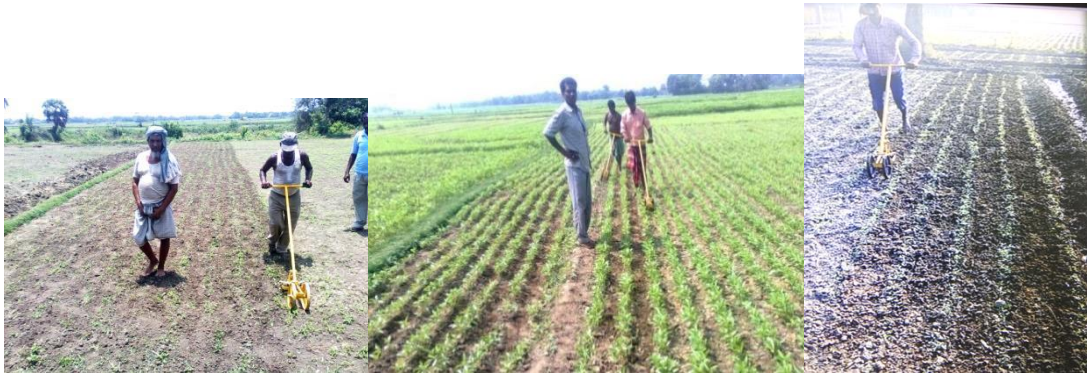
Photo 3. Simultaneous weeding, thinning, line arrangement, soil aeration and soil mulching in broadcast jute using Agricultural Weeder with Nail Assembly