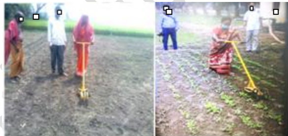
Photo 8. Agricultural Weeder with Nail assembly in other field and horticultural crops