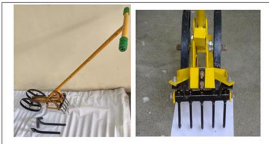
Photo 1. Agricultural weeder with nail assembly, Design registration no. 289754 in class 15-03, dt. 13-09-2019, Patent Office Kolkata, Govt. of India

Time of application, precautions and procedure of use: For composite weed control at emerging stage, the tool with its nails has to be operated with to and fro movement at field capacity stage of soil (5-7 days after emergence of crops). Opening the central nail, the tool can be operated over crop rows (10 cm tall) and the weeds within the rows can be controlled. For