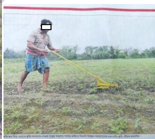
f) Coverage of Agricultural Weeder with Nail assembly in farmers field by Bengali leading newspaper “Ananda Bazar Patrika”

Commercialisation of the tool by MOU with ICAR-CRIJAF: i) M/s. Krishi Udyog, Samabaya Pally, Bally, Howrah, W.B. Pin-711205, 2014. Mob: 9432580161. Email: krishiudyog100@gmail.com . ii) M/s. Creative Displayers, 55(26) S.N. Banerjee Road, Barrackpore, W.B. Pin-700120, Mob: 9830543631. email: sanjib_b2@yahoo.com