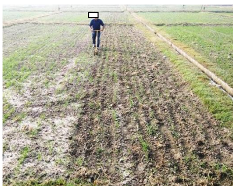
b) Mechanical weeding in wheat