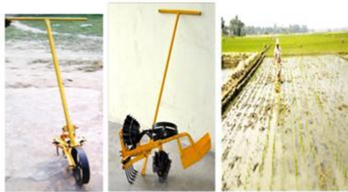
Photo 3. Simultaneous weeding, thinning, line arrangement, soil aeration and soil mulching in broadcast jute