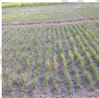
e) Bengal gram (Chick pea) assembly in farmers field