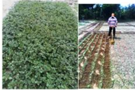
Photo 5. Weed control “ within rows ” in sunnhemp by Agricultural Weeder with Nail assembly opening its central nail.