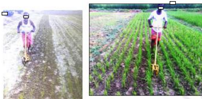
a) Mechanical weeding in upland direct seeded rice (DSR) and transplanted rice