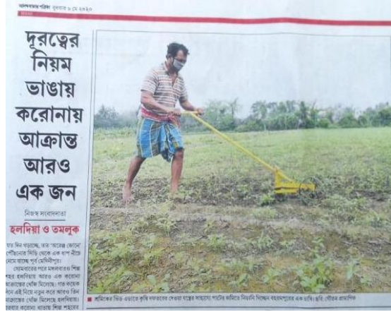
e) Bengal gram (Chick pea) f) Coverage of Agricultural Weeder with Nail Assembly in farmers field by Bengali leading newspaper “Ananda Bazar Patrika”

COMMERCIALISATION OF THE TOOL BY MOU WITH ICAR-CRIJAF: i) M/s. Krishi Udyog, Samabaya Pally, Bally, Howrah, W.B. Pin-711205, 2014. Mob: 9432580161. Email: krishiudyog100@gmail.com . ii) M/s. Creative Displayers, 55(26) S.N. Banerjee Road, Barrackpore, W.B. Pin-700120, Mob: 9830543631. email: sanjib_b2@yahoo.com