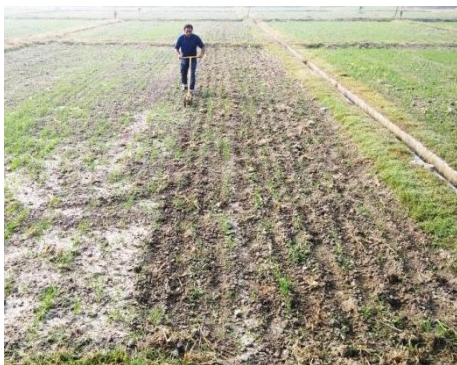
b) Mechanical weeding in wheat