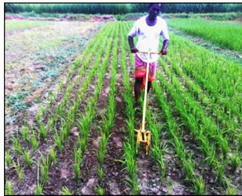
a) Mechanical weeding in upland direct seeded rice (DSR) and transplanted rice