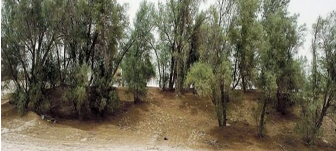
Figure 03: Casuarina spp windbreak project to stop sand encroachment in Al-Ahsa region, Saudi Arabia