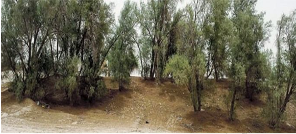
Figure 03: Casuarina spp windbreak project to stop sand encroachment in Al-Ahsa region, Saudi Arabia