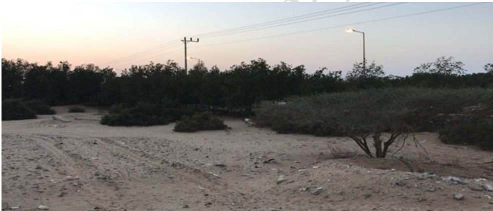
Figure 04: Conocarpus spp. and Acacia spp. windbreak project to stop sand encroachment in Al-Qunfudhah Governorate, Saudi Arabia