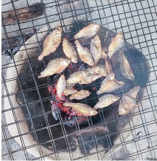
Fig. 1. Traditional smoked drying of fish ( P. sophore )