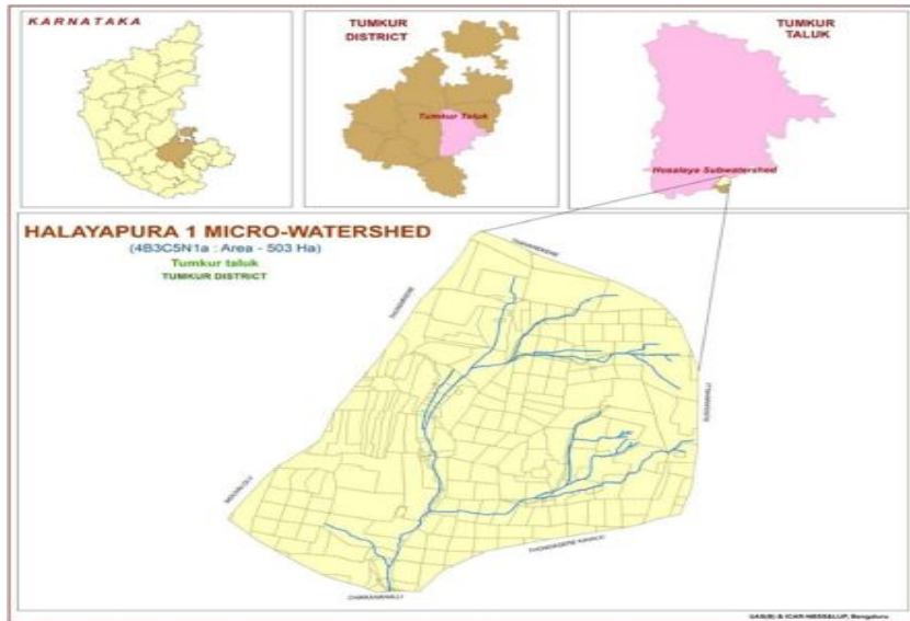
Fig. 1 .Location map of Halayapura micro watershed