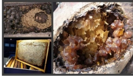
Figure 3 Types of bee hives used. Melipona beecheii in the wooden box (a), Aphis mellifera (b), Tetragonisca angustula hive in pumpkin (c).