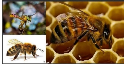
Figure 2 Tetragonisca angustula (a), Aphis mellifera (b), Melipona beecheii (c)

size of the bee in Aphis mellifera the size is usually 20 to 30 mm in length and robust, the Tetragonisca angustula is smaller measures 2 to 8 mm in length and thin and the M. beecheii is slightly larger can reach 8 to 25 mm in length and robust, as shown in Figure 2 (10)