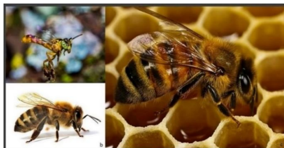
Figure 2 Tetragonisca angustula (a), Aphis mellifera (b), Melipona beecheii (c)

The best known and studied bee in our environment are the bees of the species: Apis Mellifera Africanized bee introduced in America to increase honey production. But not everyone knows about native bees such as the jimerito ( Tetragonisca angustula ) and the royal bee jicote ( Melipona beecheii ) (Figure 2), which produce an excellent quality of honey, produced entirely for medicine and supplementary food. The biological characteristics of the three varieties of bees studied are found: the size of the bee in the Aphis mellifera the size is usually 20 to 30 mm in length and robust, the Tetragonisca angustula is smaller measures 2 to 8 mm in length and thin and the M. beecheii is slightly larger can reach 8 to 25 mm in length and robust, as shown in Figure 2 (10)