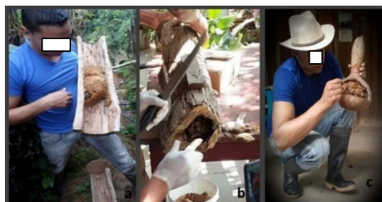
Figure 4 Extraction of Honey from hives. Melipona beecheii in trunk, EPL (a), Honey harvest (b), Tetragonisca Angustola hive in pumpkin(c).