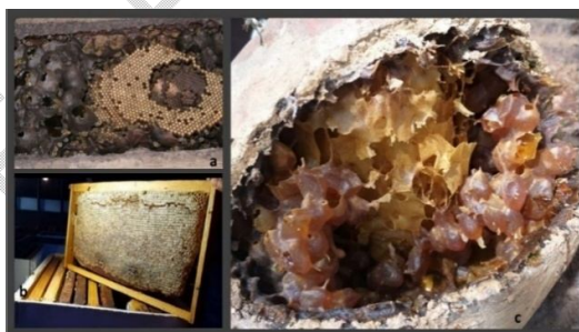
Figure 3 Types of bee hives used. Melipona beecheii in the wooden box (a), Aphis mellifera (b), Tetragonisca angustula hive in pumpkin (c).

This species as well as the native or melipona bees, they are considered as the main pollinators of some wild and cultivated plants (flowering plants or angiosperms). In this way, they help the conservation of ecosystems and improve the quality and quantity of agricultural products. Most bees are hairy-bodied and have a feathery appearance; they carry an electrostatic charge with which they attract small pollen particles. All of this helps the pollen stick to your body. With their legs they transfer pollen to pollen baskets that can be of two types: cups or corbiculas. The physicochemical characteristics of the honey produced by A. mellifera in terms of humidity has 25%, Degrees °Brix 77.9, total solids 83.45%, sugars 69.1%, acidity 40% with pH 3.8, light color and viscosity and flavors different sweet types. (15)