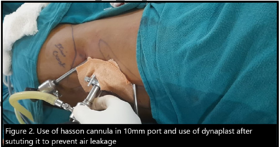
Figure.2 Use of hasson cannula in 10mm port and use of dynaplast after suturing to prevent air leakage.