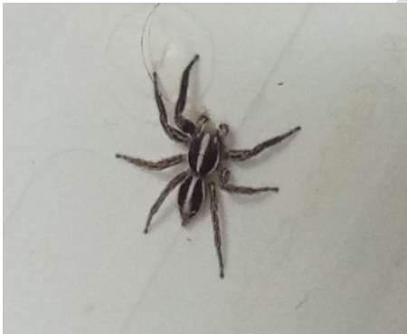
Fig-I (Male Dorsal View)

were the male spider was maintained. This observation indicates that may be only the female can spin the web in captivity. The web was white in color, sheet like in appearance and sticky in texture. When the web was removed it was able to be molded in to long strand as presented in the Fig: X. The male spider was identified with typical zebra type stripes on the dorsal surface. Both the dorsal view and frontal view of the spiders are depicted in Fig, I and II. The female spider was brown in color, and did not show, the zebra pattern on the dorsal surface. The female was found devouring the prey as shown in fig IV after being released from captivity. Figs V, VI, and VII clearly depict the matted, or sheet like appearance of the web spun by the female of Plexippuspetersi . Fig-VIII, depicts the loose web sheet web, which was spun by the female on the roof, when she was free. Fig IX, depicts, the white and sticky web. FigX, shows, the web which can be molded in to a filamentous structure.