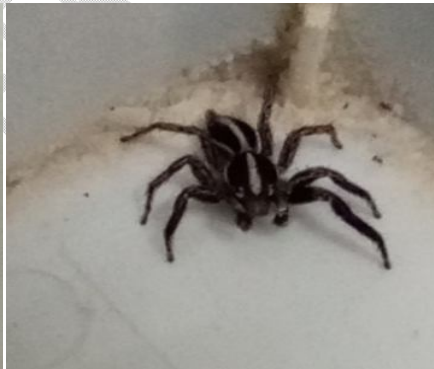
Fig-II (Male - Frontal View)