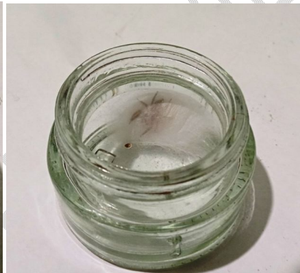
Fig-VI- Sheet like Web