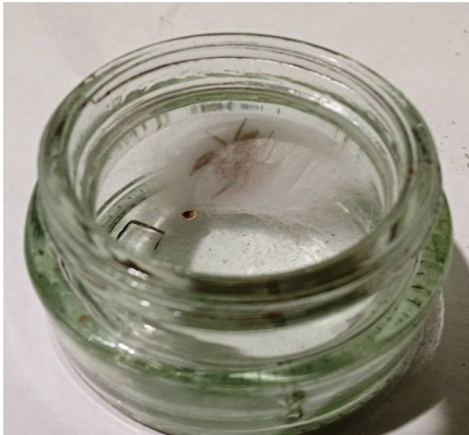
Female spinning the web