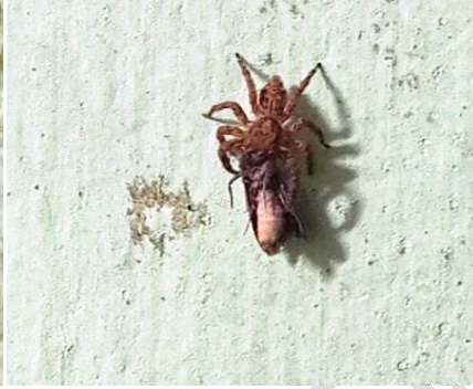
Fig-IV female devouring the prey