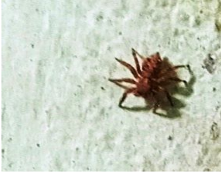
Fig-III Female (Dorsal View)