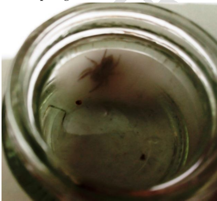
Fig-VII female inside a web in captivity