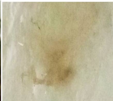
Fig-VIII Natural web by the female