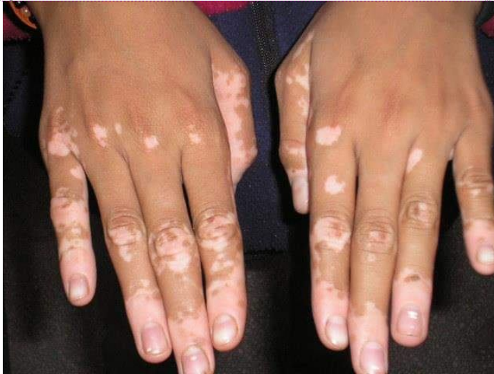
Figure 1: Patient of vitiligo [13].

Although there is still disagreement as to what the actual etiology of vitiligo is, doctors and other medical experts have narrowed down to a few of the risk factors that they believe are to blame for the development of the disorder. Among these are an autoimmune disorder (in which the immune system of the body mistakenly targets and damages these particular cells within one's own body), heredity, burns, or accidental injury, and at the same time, Some studies have suggested that stress also plays a significant role in the development of this disorder [8].