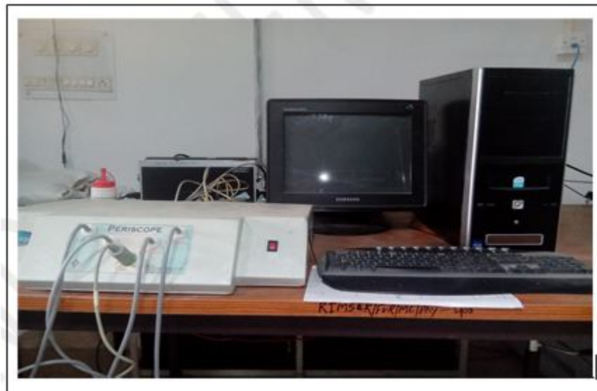
Figure-1: Elements to record non-invasive cardiovascular parameters (PC based cardiovascular analyzer or Periscope).

All the pressure recordings were done as per earlier methods developed by us [9]. SBP, DBP, PP, Heart rate or Pulse Rate (PR), brachial ankle (ba) PWV of both right (R ba PWV) and left (L ba PWV), carotid femoral pulse wave velocity (c-f) PWV) were recorded both before and after following IAYT (Figure-2 &3) in all subjects included in both group A & B. Ankle brachial index (ABI) on both right and left were also recorded both before and after following IAYT (Figure-2 &3) in all subjects included in both group A & B[9-10].