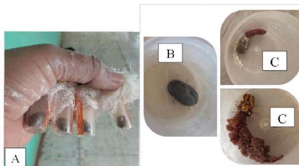
Figure 4: Specimen tubes (A & B) with female ticks (C).