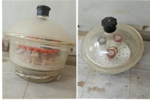
Figure1: Maintain of ticks (larvae, nymphs and adults) under laboratory conditions.