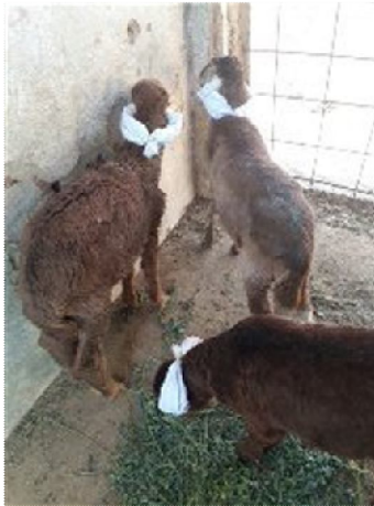
Figure 2: Feeding of ticks on sheep using the ear bag method.

The newly emerged larva, nymph and adult were kept under laboratory conditions using specimen tubes and a glass desiccator as described above for 7 days for hardening before settled on sheep,. The feeding was performed using the ear bags method (Figure 2). Briefly, the ears of sheep were shaved, washed with soap, dried and then disinfected with absolute alcohol. The ticks were placed to feed on sheep inside cotton cloth bags, which were fixed at the base of the ears using adhesive and a blaster. For each stage of H. dromedarii (larvae, nymph and adult), three sheep were used. Approximately, 1,500 larvae (500 larvae / animal), 300 nymphs (100 nymphs / animal) and 30 adults (5 females and 5 males / animal) were settled on sheep.