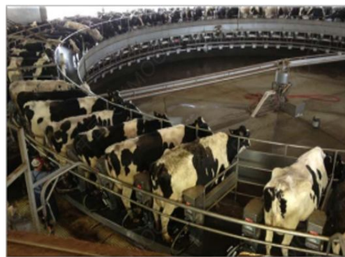
Fig. 5. Mechanized milking equipment