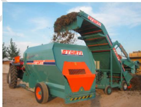
Fig. 3. Specialized transport vehicles with self-unloading function

(Figure 3), filled with fast transport to the silage cellar, and finally with heavy machinery loader using progressive wedge silage, each filled 20 ~ 30 cm, with heavy machinery pile high pressure solid. After the silage raw materials are filled, it is necessary to continue loading until the raw materials are about 60 cm above the edge of the cellar, then covered with plastic film, and then compacted with soil or tires, soil thickness 30 ~ 40 cm, so that the top of the cellar rises. After heavy machinery compaction and sealing, a density of 750 kg/m 3 can be achieved. In general, cows need an average of 25 kg of corn silage per head per day; breeding cows need an average of 15 kg of corn silage per head per day. That is, according to the average 305 days of milk production of 7000 kg, the daily consumption of corn silage needs 19.65 tons, a thousand cattle farms need at least 10,000 cubic meters of silage cellar and the annual storage of at least 7000 ~ 8000 tons of whole plant silage corn.