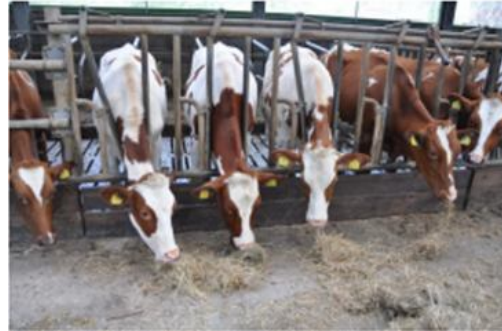
Fig. 1. Cow neck shackles

dehorning, calving and other veterinary treatment activities. The application of this equipment greatly reduces manual labor intensity and improves overall dairy farming management.