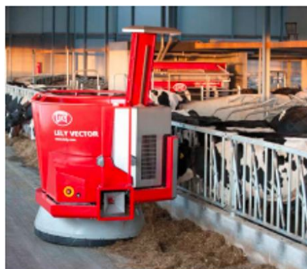
Fig. 4. Full mixed ration push sweeper

Adopt silage special (electric) reclaimer, high efficacy, reclaiming material at the same time with again shredding function, neat and smooth cutting surface, no secondary fermentation, no loss caused by rainwater soaking in the open air, and can finish loading at the same time. According to the size of the cattle herd, the mobile TMR mixer can be selected to feed 3 times a day, and the total feeding work of the feeder is 6 hours, which is 12 cubic meters for 1000 heads. The mobile TMR mixer can walk to the silage cellar, hay storage, and concentrate storage for loading and transport directly to the barn for feeding cows, which is highly efficient and saves labor costs. The complete mixed ration pushing and sweeping truck can push the feed to the cow's mouth while simultaneously cleaning the feeding trough and mixing the feed (Figure 4). During the feed pushing and brushing process, the feed is also mixed evenly and the same moisture level is maintained.