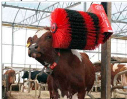
Fig. 2. Cow body brush

Cow body brush (Figure 2): It is made of special and durable material. The use of a unique induction device so that when the cow's body passes through the cow body brush automatically rotates work; when not in use can also automatically stop; easy to use, energy saving, and safe, greatly reducing the breeding of dirt and parasites on the cow's body, reducing the spread of germs and infection rate of cows, promote blood circulation, to ensure the health of cows, to protect the high yield of milk; bail frame. The new holding frame is now mainly divided into fixed, mobile, multi-functional, and other kinds. Its main purpose is to fix the cow, which is convenient for veterinarians and breeders for breeding, hoof trimming, treatment, immunization, expectation testing, embryo transfer, and other work.