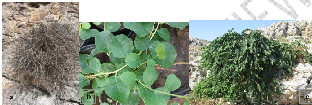
Figure 1. (a) Adult caper shrub in vegetative rest; (b) new leaves (c) adult caper shrub in vegetative stage

(Abidi, 2014). The leaves of this species are distinctly oval, with a rounded tip and a distinctly cordate base, sometimes succulent, due to the absence of spines. They are often deciduous at the juvenile stage (Rouissat, 2017). They are alternate, whole, simple, rounded to oval. They are light green in color, well developed and clearly petiolated with a network of veins protruding from the paler lower side (Kenny, 1997). These leaves are characterized by relatively thick cuticles capable of restricting the transpiration of the plant in dry and difficult conditions. The leaves of the caper have at the base two stipules transformed into fine bristles which become deciduous giving the appearance of plants without spines in the botanical variety C. spinosa var. rupestris or inermis (Pottier-Alpetite, 1979) (Fig.1).