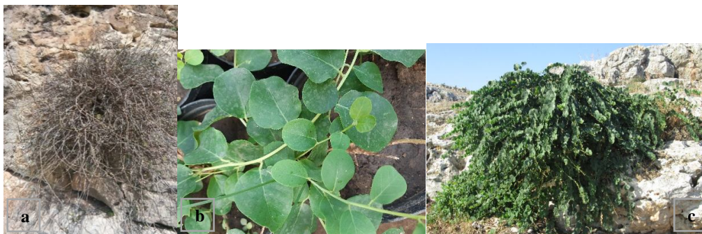
Figure 1. (a) Adult caper shrub in vegetative rest; (b) new leaves (c) adult caper shrub in vegetative stage

which become deciduous giving the appearance of plants without spines in the botanical variety C. spinosa var. rupestris or inermis (Pottier-Alpetite, 1979) (Fig.1).