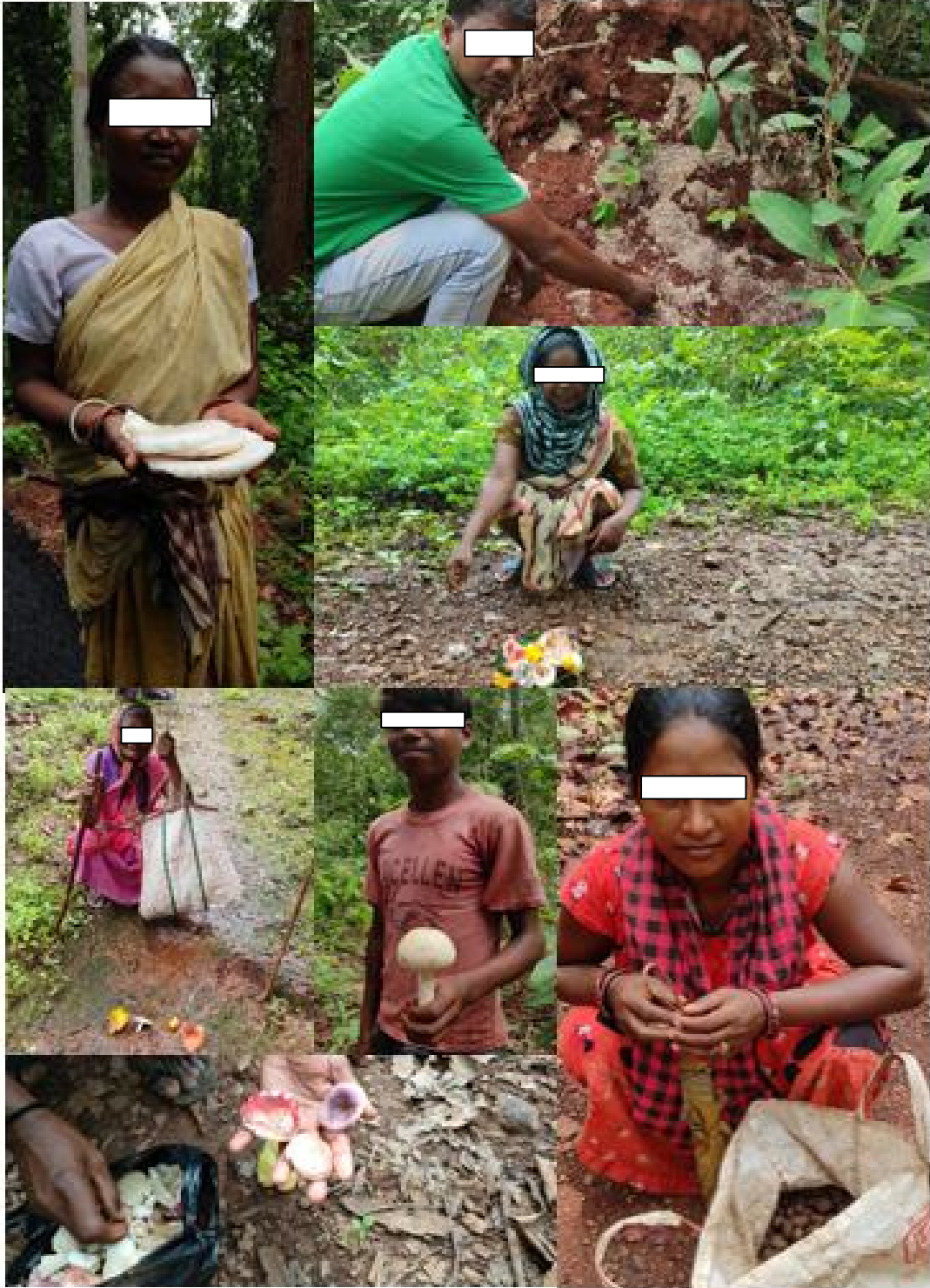
Plate 4: Survey works and collection of information on food, medicinal and economic values in Bonai Forest Division, Odisha, India