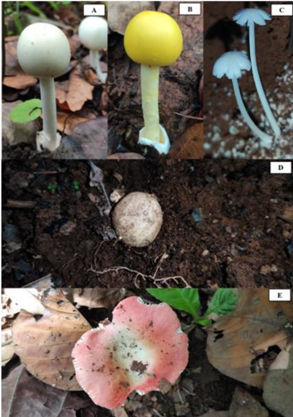
Plate 1: Some common mushroom of Bonai Forest Division, A) Amanita egregia , B) Amanita caesarea , C) Termitomyces microcarpus , D) Astraeus hygrometricus , E) Russula rosea