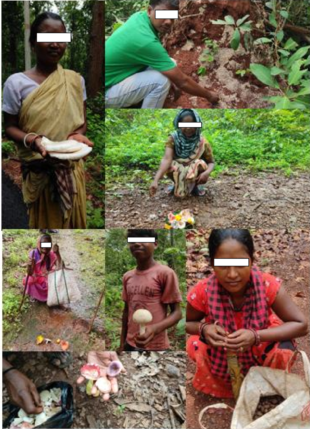
Plate 4: Survey works and collection of information on food, medicinal and economic values in Bonai Forest Division, Odisha, India