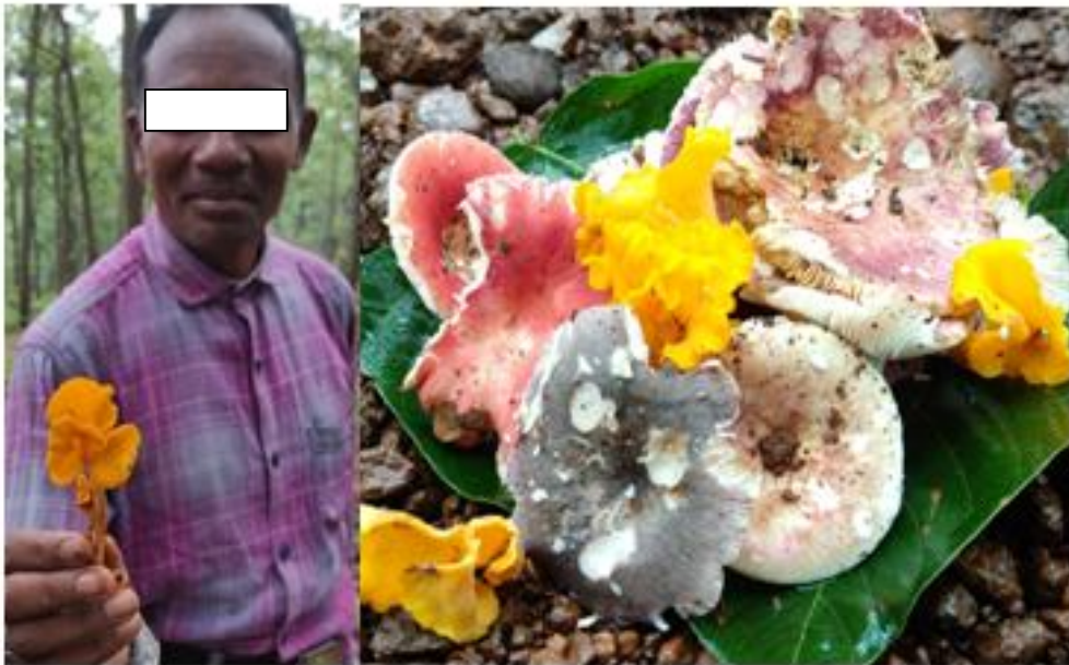
Plate 6: Collected wild mushrooms by local for selling purposes