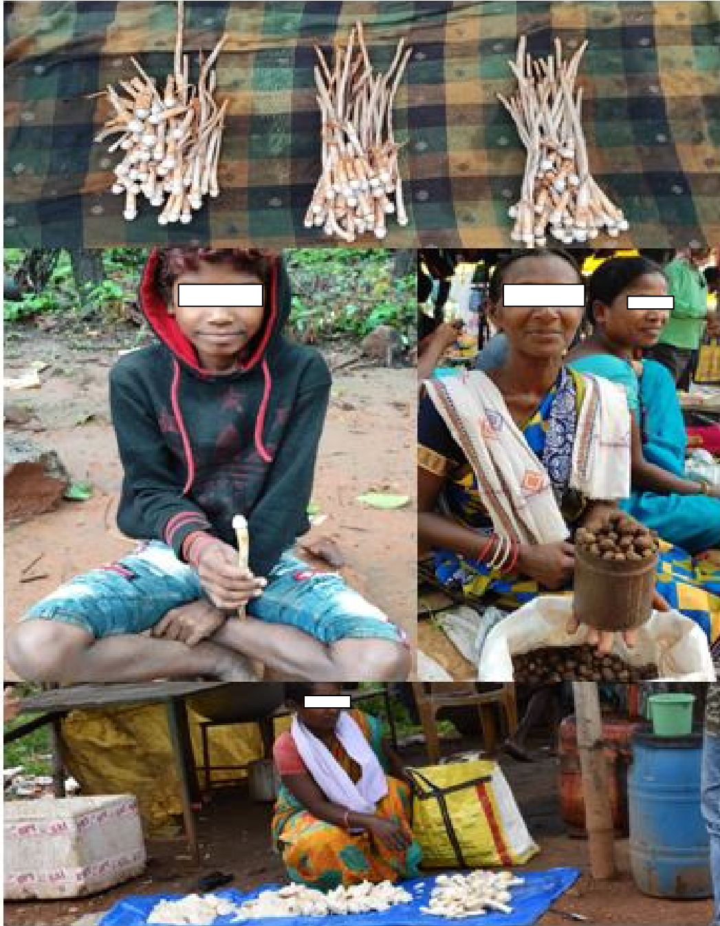
Plate 3: Wild mushrooms as a source of livelihood in Bonai Forest Division, Odisha, India