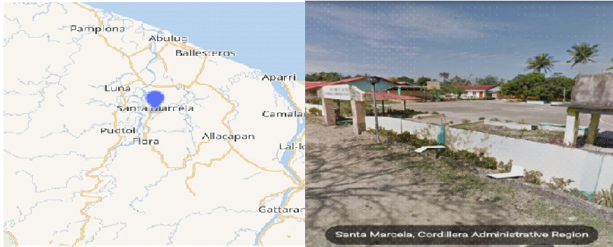
Figure 2: This figure shows the locale of the study.