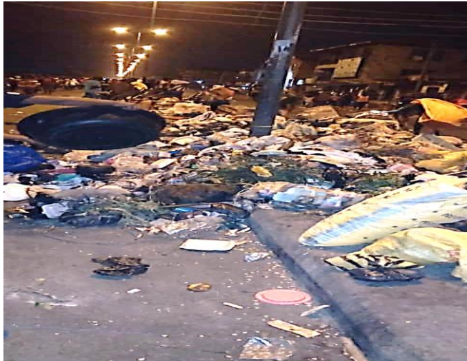
Figure 3: Dumping of Garbage along Ikwerre Road (Mile 2)