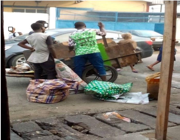
Figure 2: Method of Garbage Disposal by Households