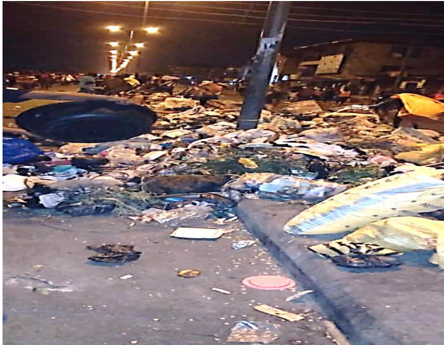
Figure 3: Dumping of Garbage along Ikwerre Road (Mile 2)