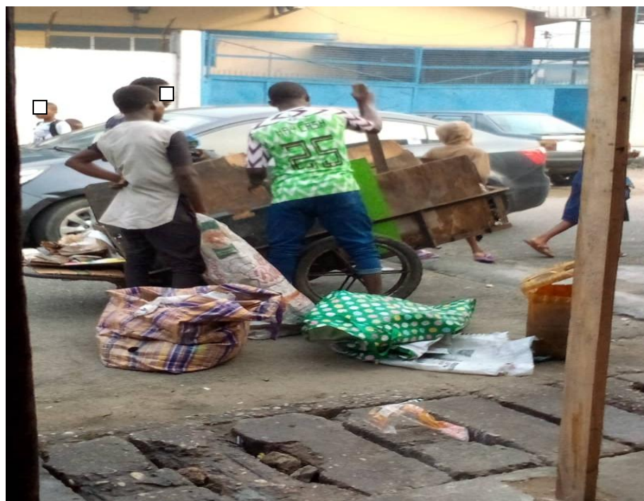
Figure 2: Method of Garbage Disposal by Households