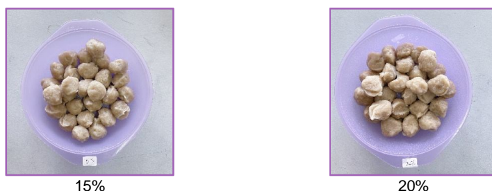
Fig 1. The appearance of baksoikanleledenganpenambahantepungtulangkanlele