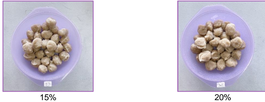
Fig 1. The appearance of bakso ikan lele dengan penambahan tepung tulang ikan lele