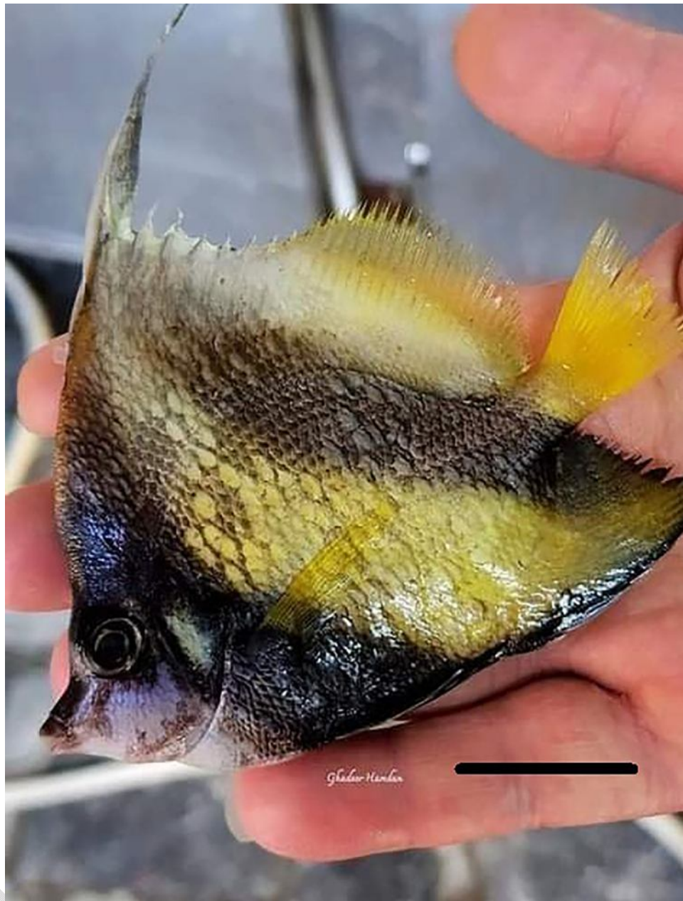
Figure 1. Specimen of H. intermedius caught from the coast of Baniyas on May 28 th 2022. The total body length: 14 cm, and the height of the fish body is 12 cm. Scale bar= 30 mm