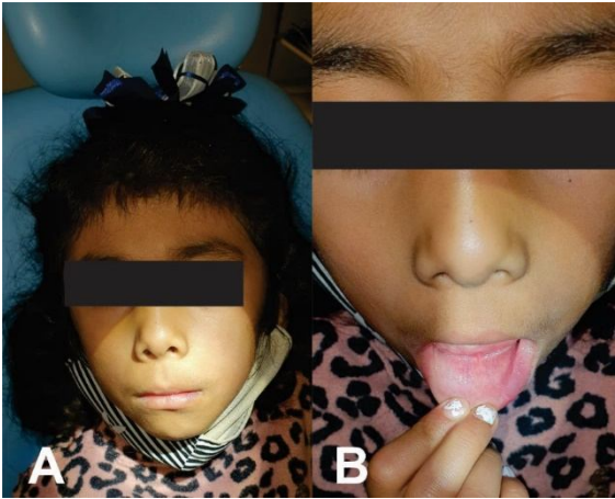
Fig 3: A) Post-surgical physical examination at 22 days, normochromic tissues are appreciated, without pathological data. B) Intraoral examination shows normochromic tissues, normothermic, without pathological data