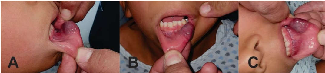
Fig. 1: An increase in volume can be seen in the lower left lip, brown in color, with well-defined edges and a sessile base. A) Lateral view of the left lower lip showing an increase in volume that extends from the lip to the bottom of the sac. B) frontal view of the tumor lesion that extends from the midline to the corner of the lips. C) Superior view that extends from the vermilion of the lips to the mucosa of the oral cavity.

on the lower lip on the left side that makes the lips incompetent at closure, brown with Positive diascopy and slow capillary refill after pressure relief. Sessile based. It does not seem to be at the expense of the muscular plane, asymptomatic with a superficial lesion in the occlusal area. Intraoral examination shows multiple caries in the deciduous dentition. (Figure 1)