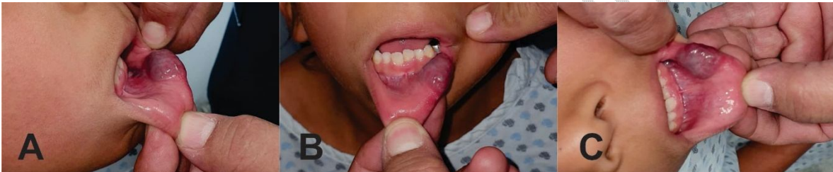
Figure 1: An increase in volume can be seen in the lower left lip, brown in color, with well-defined edges and a sessile base. A) Lateral view of the left lower lip showing an increase in volume that extends from the lip to the bottom of the sac. B) frontal view of the tumor lesion that extends from the midline to the corner of the lips. C) Superior view that extends from the vermilion of the lips to the mucosa of the oral cavity.

No relevant history for his current condition. On physical examination, a normocephalic skull was observed, exostoses and/or sinking were not palpable, symmetrical, complete eyebrows, orbital rim without a solution of continuity, eyes with isochoric pupils, with light reflexes of photomotor and consensual accommodation. Patent nostrils, no signs of deviation in the nasal septum, hyperemic oropharynx, hypertrophy, no retroload, no exudate. The patient presents an apparent chronological age, aligned, alert, oriented, neurologically in line with Glasgow 15. A 14x14mm lesion can be seen on the lower lip on the left side that makes the lips incompetent at closure, brown with Positive diascopy and slow capillary refill after pressure relief. Sessile based. It does not seem to be at the expense of the muscular plane, asymptomatic with a superficial lesion in the occlusal area. Intraoral examination shows multiple caries in the deciduous dentition. (Figure 1)