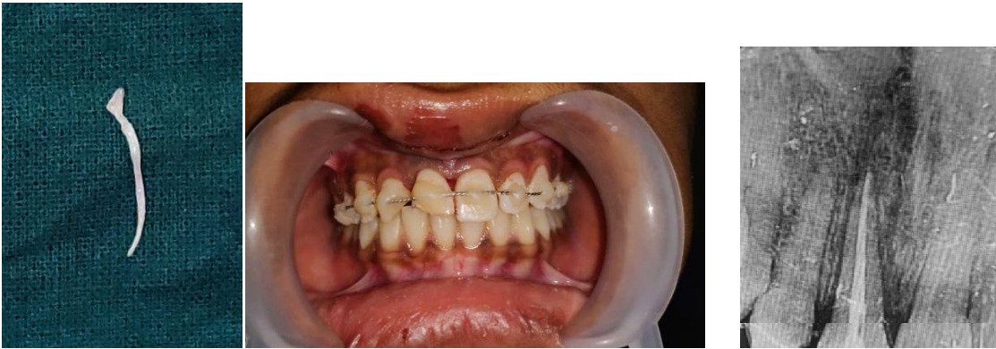
(FIG 2) ROOT SURFACE OF THE TOOTH

The occlusion was checked to make sure that there was no pre mature contacts. Radiograph was taken to verify the position of the tooth. Patient was advised to take only soft diet and the necessary oral hygiene instructions were given. After 4 weeks, as the patient was asymptomatic, the splint was removed and composite build up was done for 11 and 12. Recall visits were scheduled after 1 month,3 months and 6 months. The 3 month radiograph showed slight resorption (Fig3) and it was slightly increased in the 6 months radiograph.(Fig4)