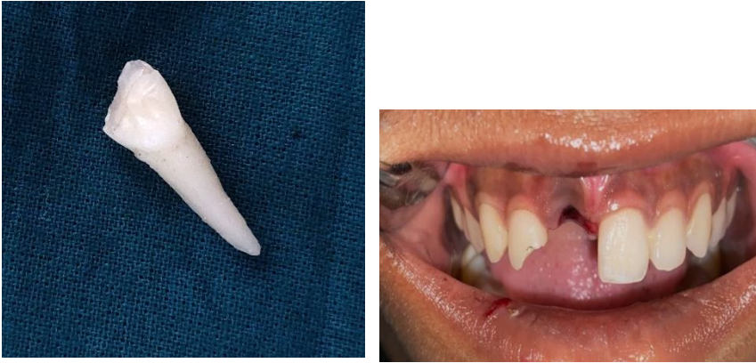
(Fig 1) Morphology of teeth

examination, laceration and slight swelling of the upper lip was noted. Intra oral examination revealed empty socket space suggestive of avulsed tooth irt 11 and Elli's class II fracture irt 12. (Fig 1)