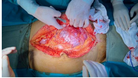
Figure 1: Diagnostic laparotomy