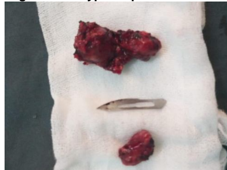
Fig. 2. Asymmetric size of tonsils