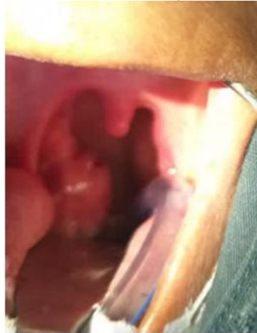
Fig. 1. Right tonsil hypertrophia with visible nodule

At the one-month post-operative check-up, the patient was symptom-free and healing was complete.