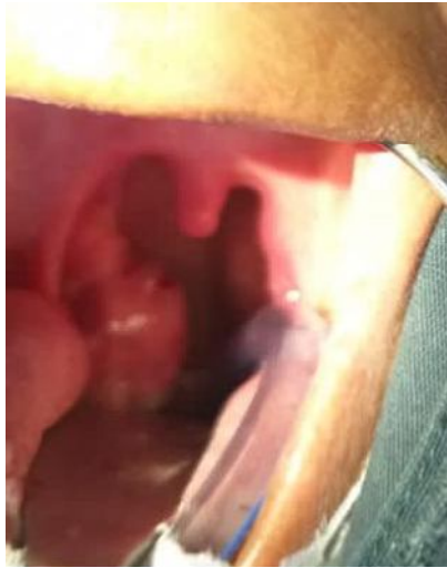
Figure 1: right tonsil hypertrophia with visible nodule

At the one-month post-operative check-up, the patient was symptom-free and healing was complete.