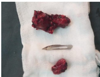
Figure 2: asymmetric size of tonsils