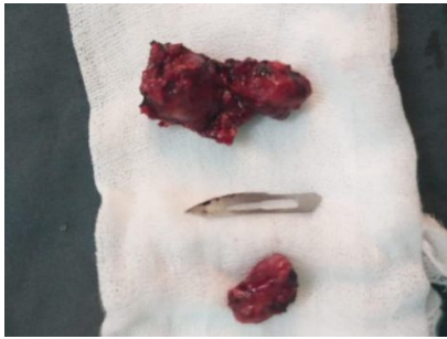
Figure 2: asymmetric size of tonsils

The picture is upside down. Photographs must be taken in close-up, to see the evidence well