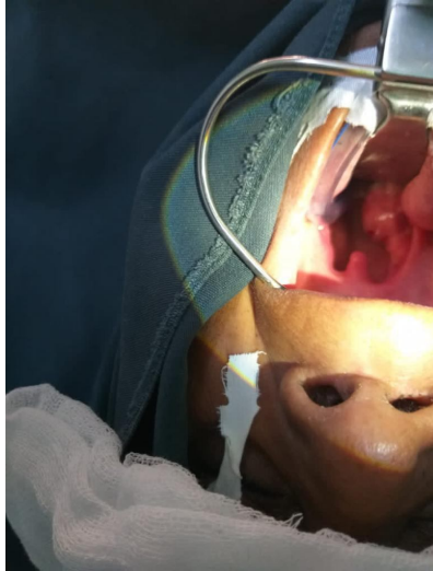
Figure 1: right tonsil hypertropia with visible nodule