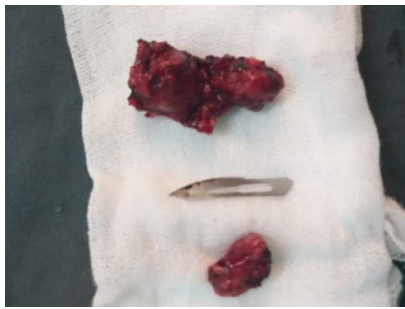
Figure 2: asymmetric size of tonsils