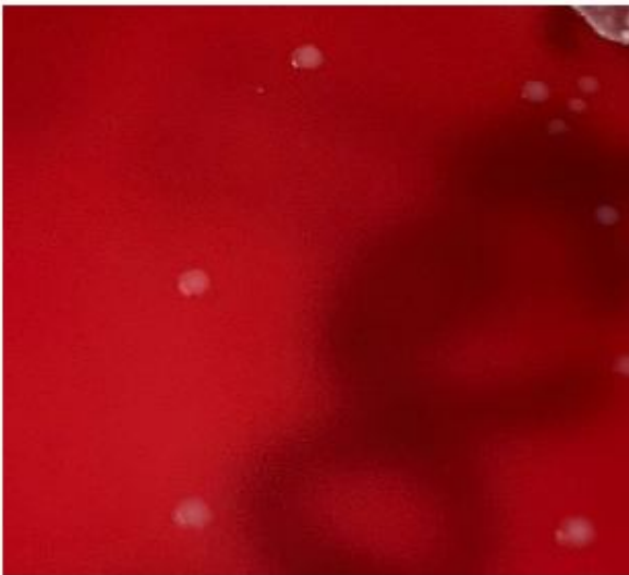
Figure 2. Detail of F. vaginae colony in Columbia blood-agar.