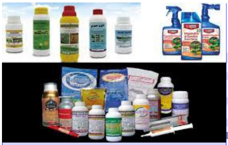
Fig 1: Different pesticides

Comment [A2]: Figures are labeled at the bottom.