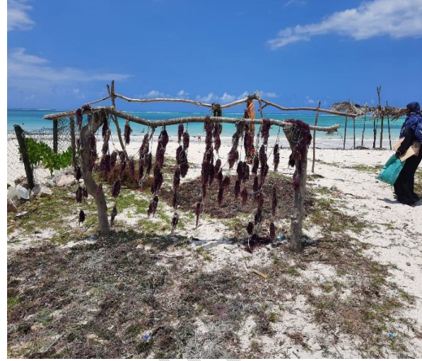
Figure 2: Drying of seaweed in Jambiani, Unguja