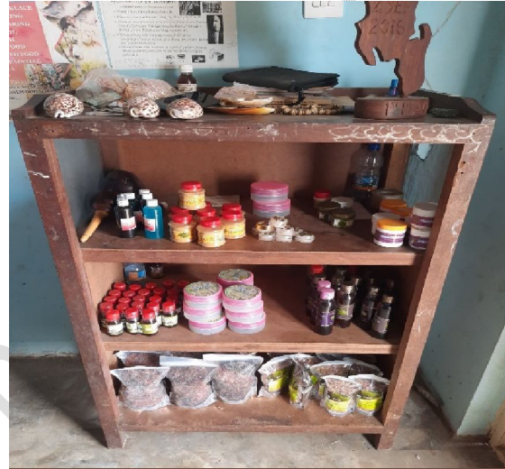
Figure 6: Value-added seaweed products in Kidoti,

Further, it was found that the marketing challenges faced by the industry's producers are also linked to limited marketing and promotional skills. Most farmers expressed that they cannot identify markets for their products and rely almost entirely on fellow farmers and exporters through village collection centres. Most farmers from Unguja Island (138/291) rated themselves as having weak marketing skills compared to 34.4% from Pemba (104/301) (source: study survey, 2021). About 30.7% of seaweed farmers from Unguja (89 farmers) rated themselves as having very weak marketing skills compared to 16% of farmers in Pemba (48 farmers) (source: study survey, 2021).