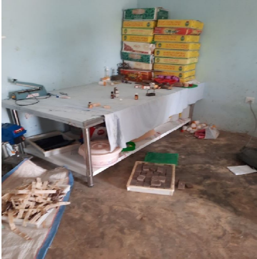
Figure 5: Value-addition site in Kidoti, Unguja

Value-added seaweed products attract higher price margins than raw seaweeds; for instance, seaweed flour can be sold for TZS 10,000 (US$ 4.32) and soap up to TZS 3,500 (US$ 1.51) (source: study survey, 2021). Expansion of the activities is constrained by limited seed and growth capital, lack of physical resources, e.g. machinery, training on packing and labelling, processing sites, availability of inputs and narrow distribution channels (source: study survey, 2021). The value-addition market remains untapped.