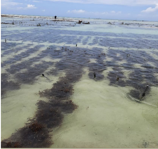
Figure 1: Seaweed farm in Jambiani, Unguja