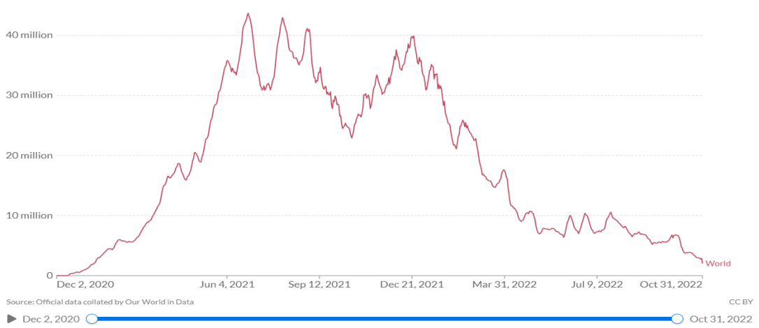
Fig 2: Daily Covid-19 vaccine doses administered (11)

the emerging variant, was also highlighted. This was attributed to the average of 0.5 mutations which tend to accumulate over time during the infection cycle of each individual (. As a result of the high transmission rate of the virus over the globe, it can be concluded that the generation of mutations and new variants tends to rise (10).