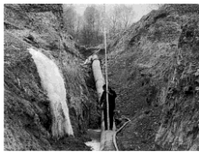
Figure 2.1 Pipe burial depth

During the construction of the pipeline, it is easy to collapse and collapse pits in the shallow part of the pipeline burial depth, and with the extension of time and the action of high water level, new collapse pits may appear, and even if there are no collapse pits, the soil will be loosened in a certain range, which is extremely unfavorable to the embankment stability and seepage resistance.