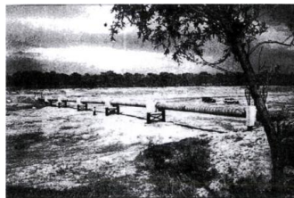
Figure 2.2 Severe exposure of an oil pipeline through a dike in the northeast (1997 situation)

From here, it can be seen that the burial depth of the pipeline can save the pipeline from the risk of being exposed by scouring if it is buried a little deeper so that the depth of the pipeline exceeds the scouring depth of the river, which can also show that the burial depth of the pipeline can have an impact on safety.