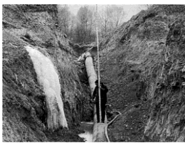
Figure 2.1 Pipe burial depth

During the construction of the pipeline, it is easy to collapse and collapse pits in the shallow part of the pipeline burial depth, and with the extension of time and the action of high water level, new collapse pits may appear, and even if there are no collapse pits, the soil will be loosened in a certain range, which is extremely unfavorable to the embankment stability and seepage resistance.