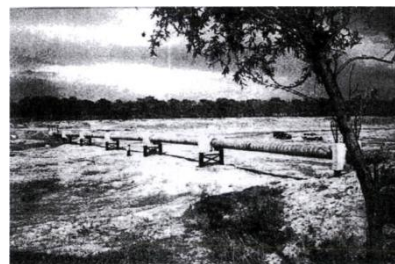
Figure 2.2 Severe exposure of an oil pipeline through a dike in the northeast (1997 situation)

From here, it can be seen that the burial depth of the pipeline can save the pipeline from the risk of being exposed by scouring if it is buried a little deeper so that the depth of the pipeline exceeds the scouring depth of the river, which can also show that the burial depth of the pipeline can have an impact on safety.