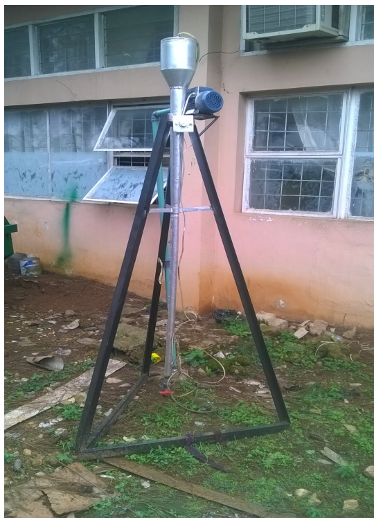
Figure 3 : Developed HHLC machine.

methanol was measured and poured into the beaker. 135.0 g of NaOH pellet was measured using an electronic precision scale (KD-TBE-1200) with a sensitivity of 0.01 g and maximum load of 1200 g and added to the methanol. The content of the beaker was stirred vigorously using Chemglass 135 mm round top analog hot plate stirrer system until the NaOH was completely dissolved in the methanol to form sodium methoxide ( \text{CH}_3\text{ONa} ). The \text{CH}_3\text{ONa} was poured into a stainless bucket containing the preheated oil and stirred using the round top analog hot plate stirrer system at a steady temperature of 60 °C (Thermo-hygrometer (CENTER 315) was used to take the temperature reading of the hot oil). This method has been effectively utilized by Ojolo et al. [18] and Eze et al. [19].