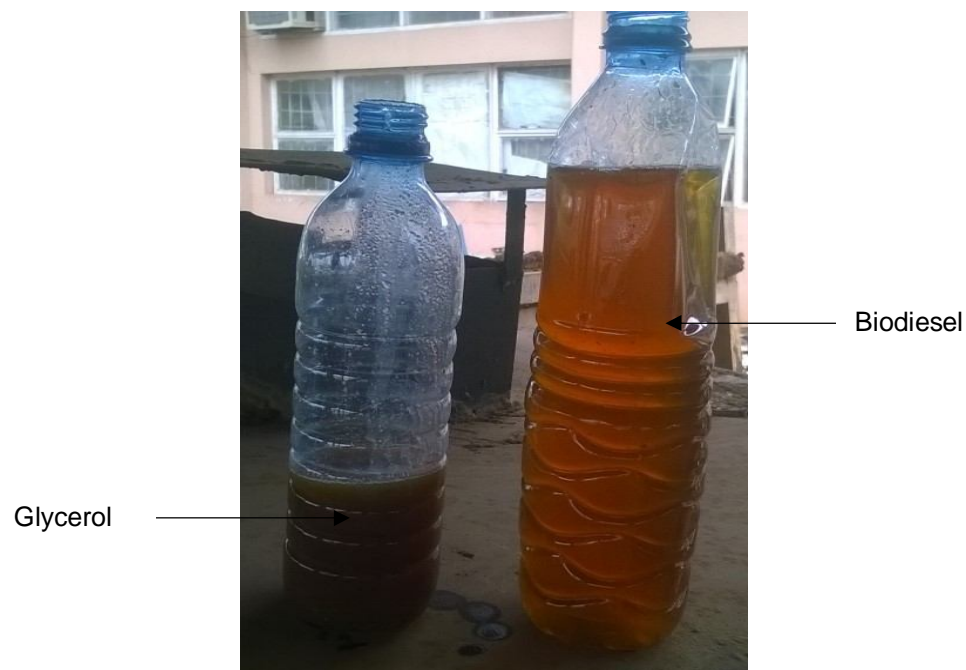
Figure 3: Glycerol and Biodiesel in container after separating process.

overflow section of the hydrocyclone. The variable frequency drive was utilized to control the speed of the pump so as to determine the effect on the discharge rate and cyclone efficiency as a whole. Two different pump pressures were utilized to determine the effect of inlet velocity on the cyclone efficiency. The Pressure at inlet for the first run of experiment was fixed at 70 kPa and that of the second run was fixed at 80 kPa. It was recorded that at constant temperature of 60 °C as the pressure rate increases, there is a corresponding increase in the discharge rate at the underflow and overflow outlets. Stopwatch was used to determine the suction rate and discharge rate. It was established that for experimental run of 70 kPa, 15 liters of PKO, 2.04 minutes was used to suck and separate the PKO and 1.67 minutes was used to separate that of 80 kPa. It was also noticed that the separation efficiency was higher during the experimental run with the higher pressure due to increase in swirling force created as a result of high pressure from the pump similar results was recorded by Oriaku et al. [23], Jing-Xuan et al. [24] and Lianjun et al. [25] when they carried out effects of inlet velocity on cyclone collection efficiency for different hydrocyclones designed. Figure 3 shows the picture of the separated glycerol and biodiesel in one of the experimental runs.