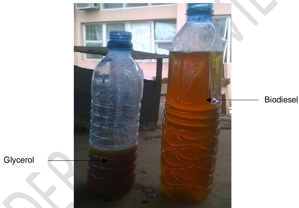
Figure 3: Glycerol and Biodiesel in container after separating process.

Pressure at inlet for the first run of experiment was fixed at 70 kPa and that of the second run was fixed at 80 kPa. It was recorded that at constant temperature of 60 °C as the pressure rate increases, there is a corresponding increase in the discharge rate at the underflow and overflow outlets. Stopwatch was used to determine the suction rate and discharge rate. It was established that for experimental run of 70 kPa, 15 liters of PKO, 2.04 minutes was used to suck and separate the PKO and 1.67 minutes was used to separate that of 80 kPa. It was also noticed that the separation efficiency was higher during the experimental run with the higher pressure due to increase in swirling force created as a result of high pressure from the pump similar results was recorded by Oriaku et al. [23], Jing-Xuan et al. [24] and Lianjun et al. [25] when they carried out effects of inlet velocity on cyclone collection efficiency for different hydrocyclones designed. Figure 3 shows the picture of the separated glycerol and biodiesel in one of the experimental runs.