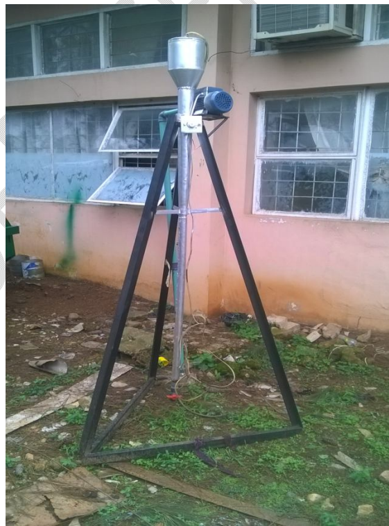
Figure 2: Developed HHLC machine.